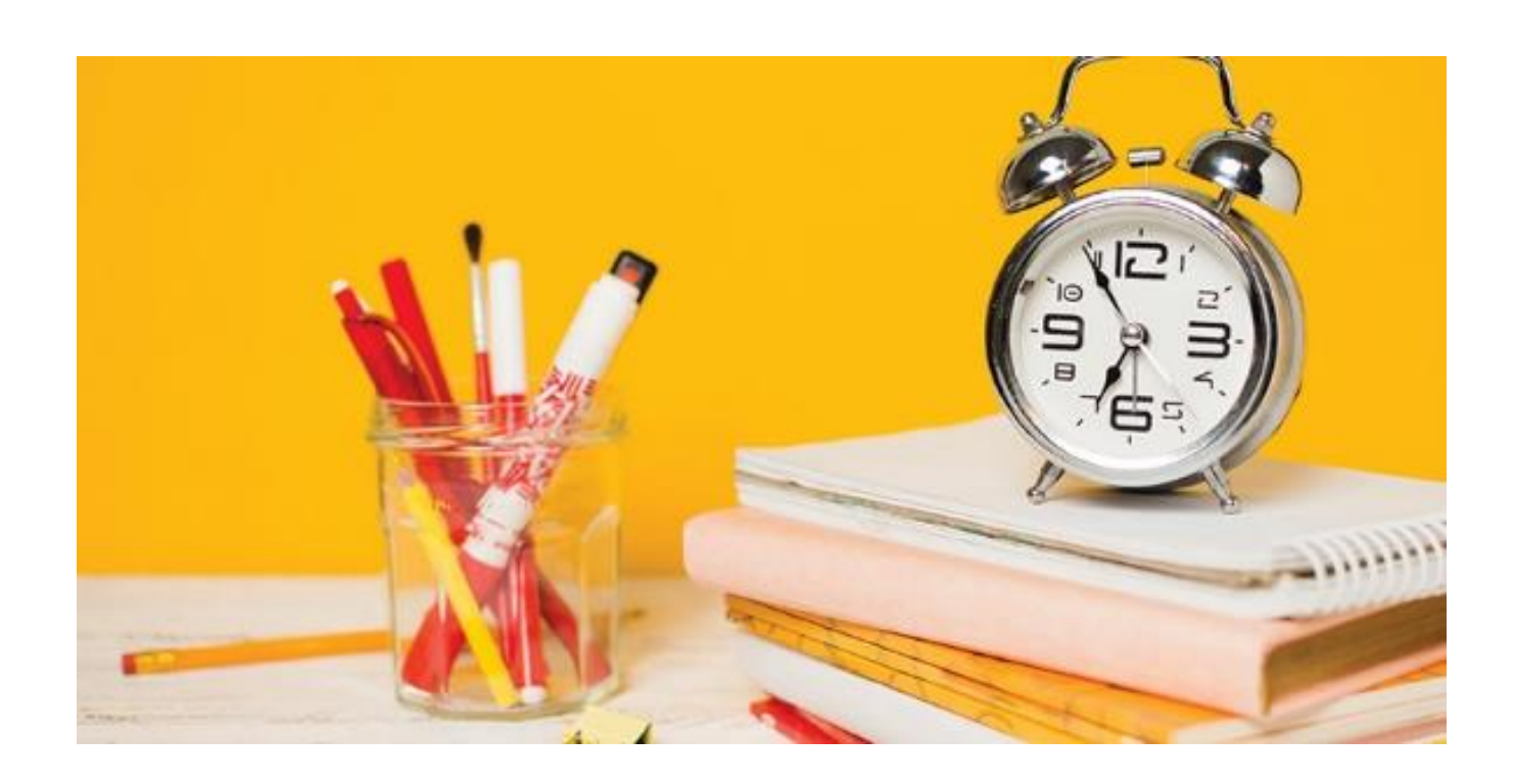
Plymouth Educational Psychology Service